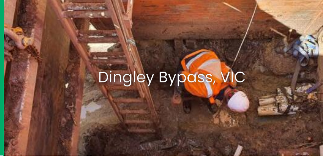
Dingley Bypass, VIC