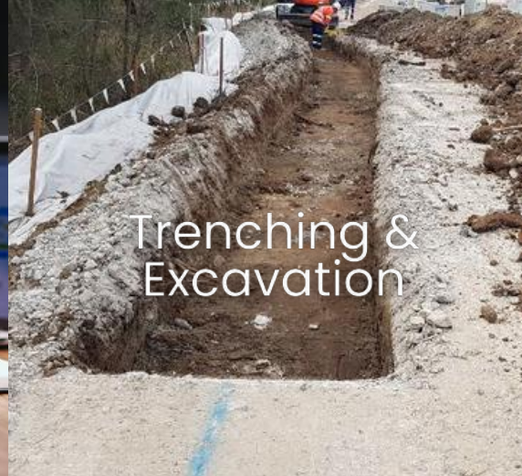
Trenching & Excavation