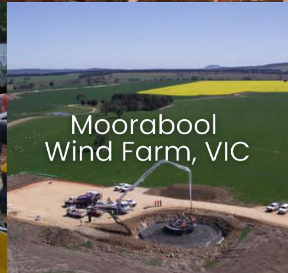
Moorabool Wind Farm, VIC