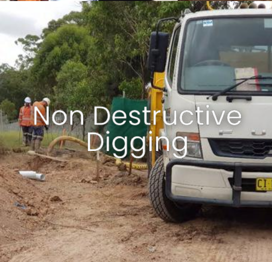
Non Destructive Digging