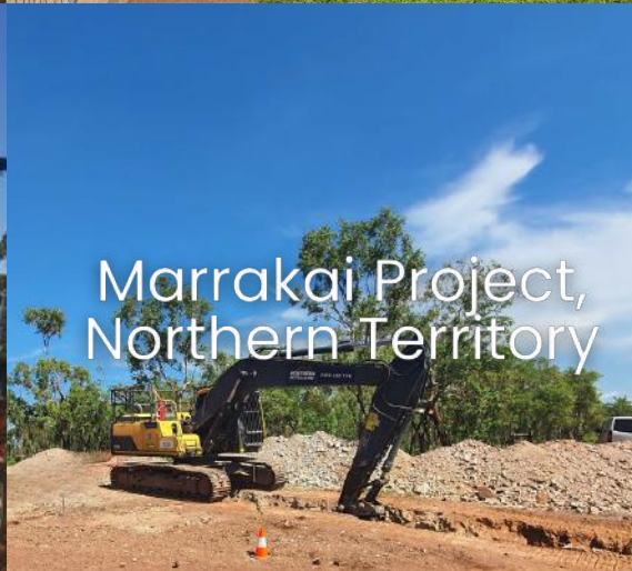
Marrakai Project, Northern Territory