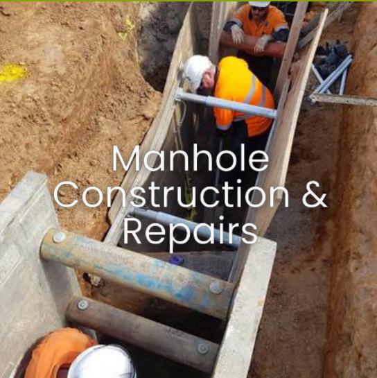
Manhole Construction & Repairs