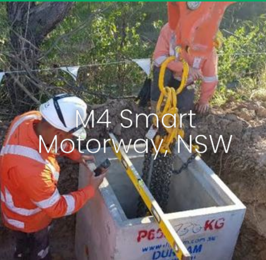
M4 Smart Motorway, NSW