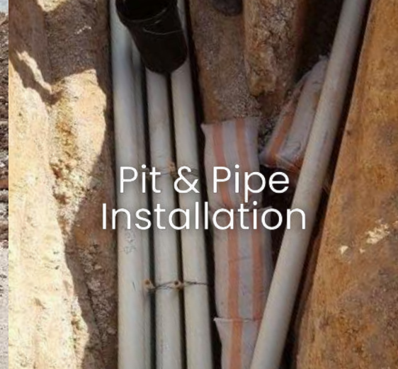
Pit & Pipe Installation