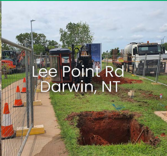
Lee Point Rd Darwin, NT