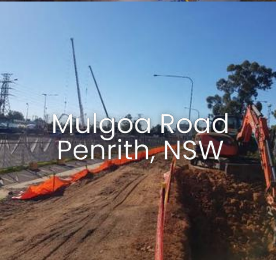
Mulgoa Road Penrith, NSW