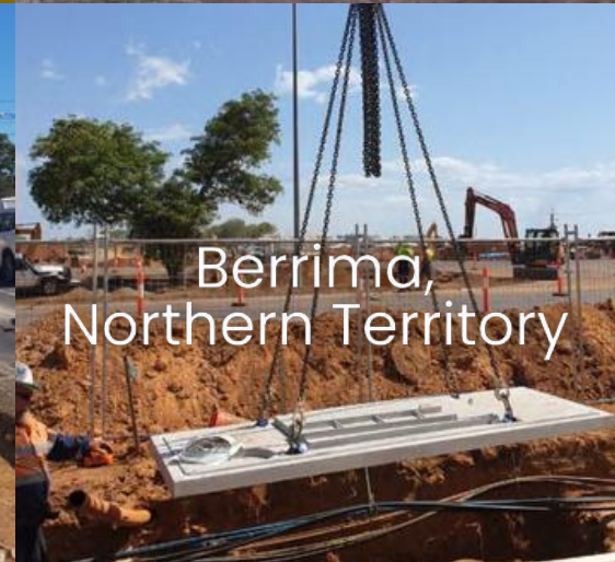
Berrima, Northern Territory