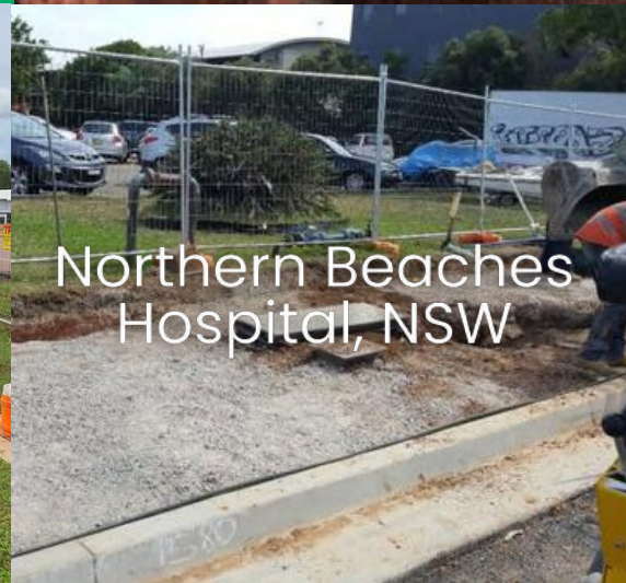
Northern Beaches Hospital, NSW