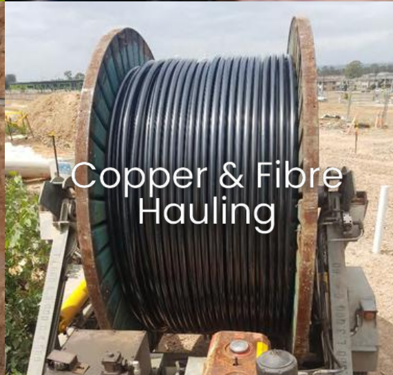
Copper & Fibre Hauling