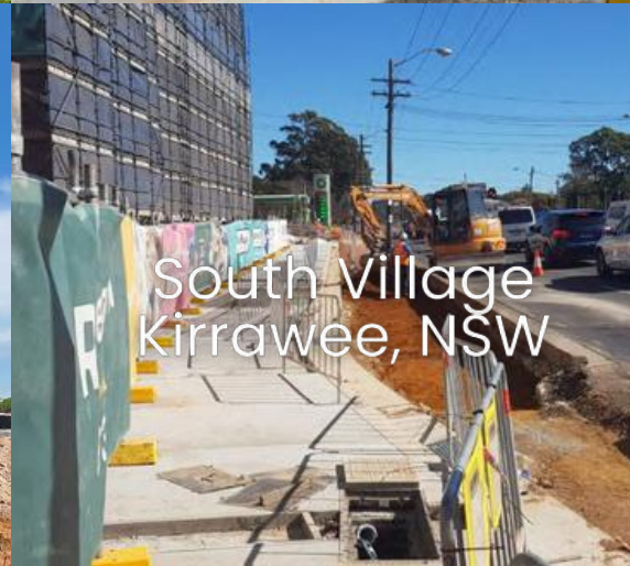
South Village Kirrawee, NSW